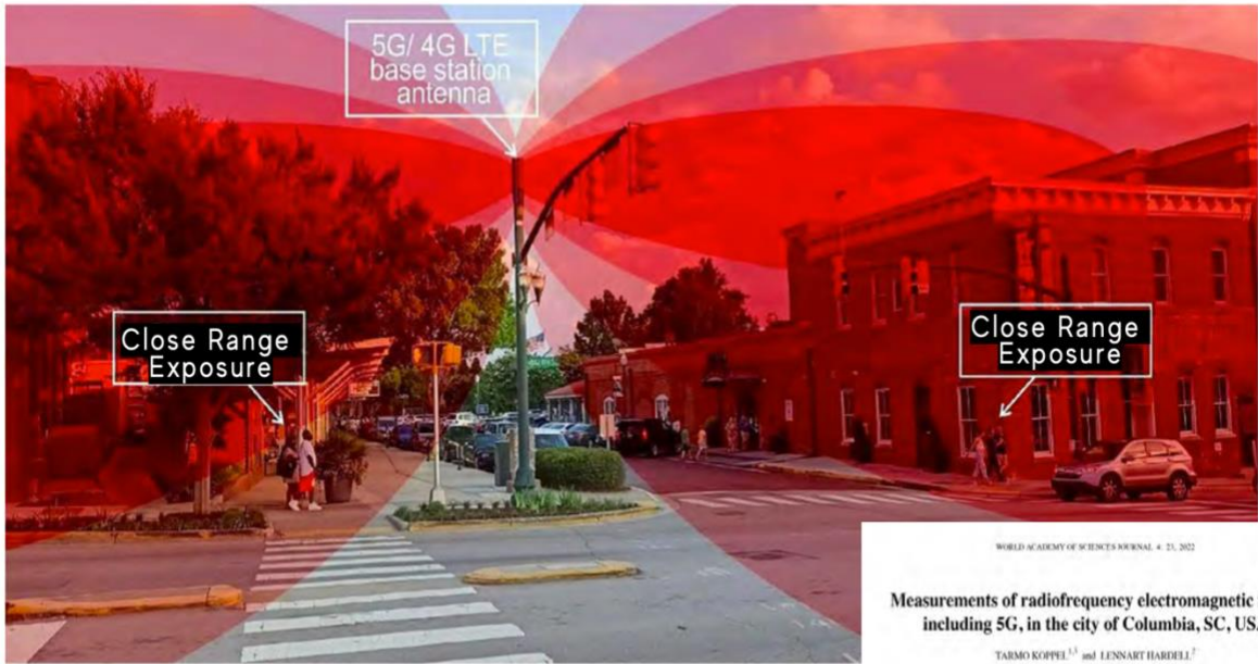
Figure 7. Gervais Street: Cell phone base station antenna placed close to street level and causing high exposure to pedestrians and nearby café visitors (exposure scenario illustration). The antenna appears camouflaged and seemingly part of a utility pole. The measurer only discovered the antenna due to the high radiofrequency levels in the vicinity.