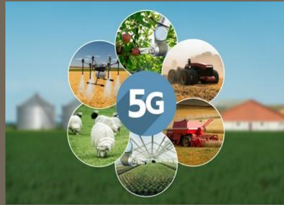
Internet of Things (IoT)

Disclaimer: The information in this brochure is for educational purposes only and any copyrighted materials herein are distributed in accordance with the Fair Use Act.